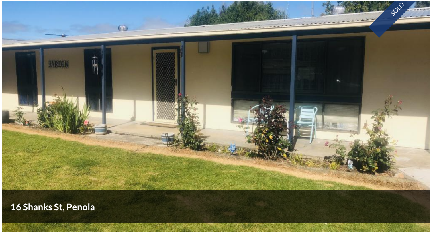
16 Shanks St, Penola