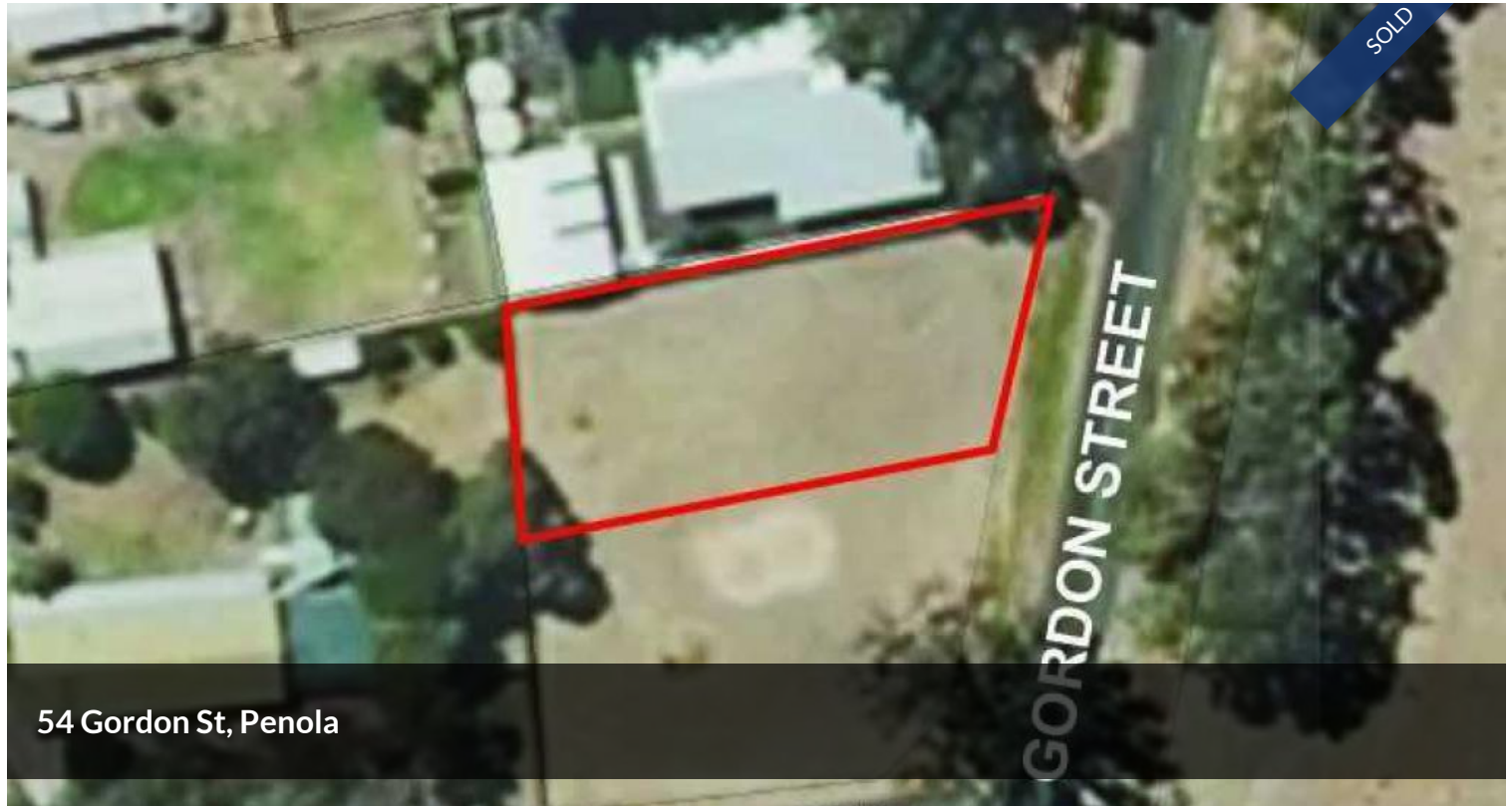
54 Gordon St, Penola