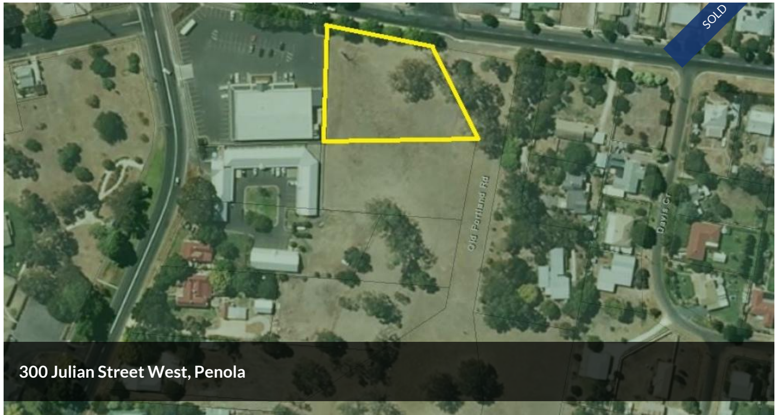
300 Julian Street West, Penola