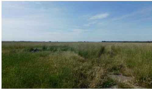
Lot 1 Andres Lane, Furner