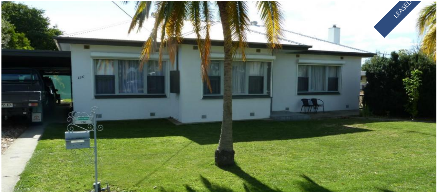
136 Church Street, Penola