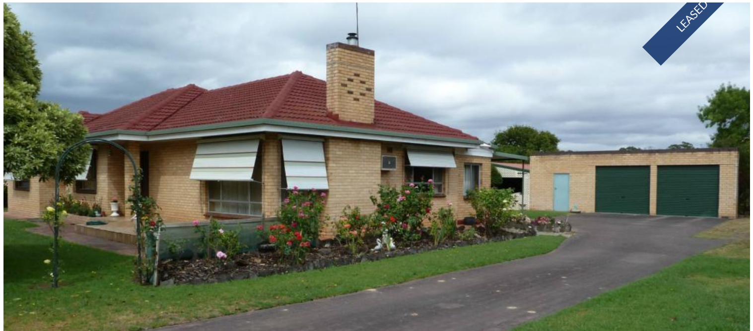
Lot 776 Riddoch Highway, Nangwarry